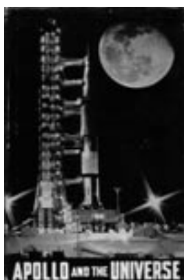
The book cover from the 1967 Science Summer School

Just to expect the unexpected and enjoy the journey! And keep those e-mail address books up to date so you can find each other in 30 years!