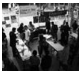
The crowds at the hands-on physics area at Sydney Uni Live

Amidst leaping metal rings, levitating superconductors and hair-raising static electricity, the winners of the first School of Physics Science Fair were announced at Sydney Uni Live in August.