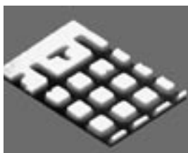
Image of the surface profile of an integrated circuit using Roy's technique

A revolutionary new microscope with applications from biological systems to electronics to astronomy is set to make the leap from academia to the commercial world.