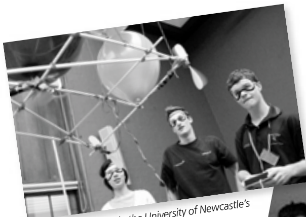
Scholars competing in the University of Newcastle's Science and Engineering Challenge

“ What sweet memories! They were brightest pages of my life! I want to say thank you very much for organizing so wonderful program, I really enjoyed it very much! I LOVE ISS!! ” (Japanese ISS Scholar)