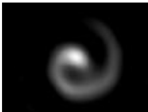
The pinwheel nebula around Wolf-Rayet 104