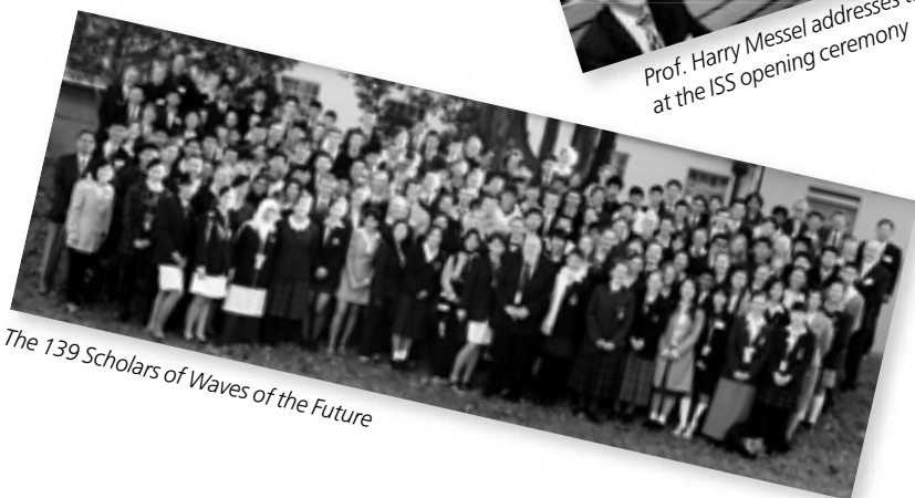
The 139 Scholars of Waves of the Future