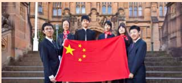
ISS2011 Chinese Scholars