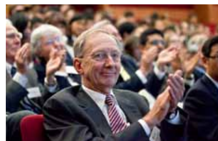
Pioneering Physicist, Professor Sir John Pendry

Every two years leading scientists from across Australia and around the world are invited to talk about their work and its impact on society. In fact, the ISS has a long list of great speakers over the decades - James Watson, who won a Nobel Prize for discovering the structure of DNA, Jerome Friedman, also a Nobel Laureate his for work on particle physics, Sir Hermann Bondi (physicist and astronomer at Cambridge University), Margaret Burbidge (astronomer with the Hubble Space Telescope), Carl Sagan (famous astronomer and science communicator) and Lord Robert May of Oxford (President of the Royal Society) have all given talks at the ISS.