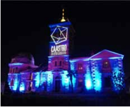
The CAASTRO logo lights up Sydney Observatory at the launch

The sky is no longer the limit, with CAASTRO, the new ARC Centre of Excellence for All-sky Astrophysics, headquartered in the School of Physics, launched by University of Sydney Chancellor, Professor Marie Bashir AC CVO, in front of an A-list of astronomers at the Sydney Observatory on 12 September 2011.