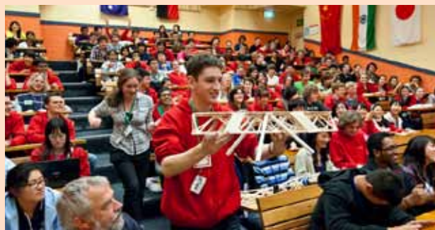
A packed Slade Lecture Theatre during the Science & Engineering Challenge